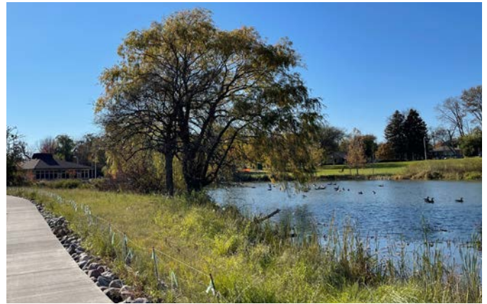
Dineen Park Stormwater Detention and Park Improvements Project, Milwaukee.