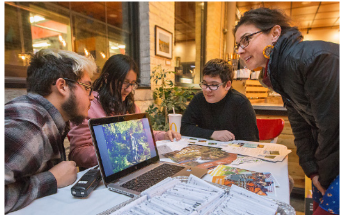
Escuela Verde students share native prairie seeds with their communities during the Día de los Muertos celebration.